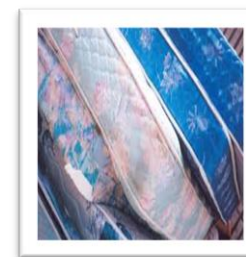
Mattresses piled high