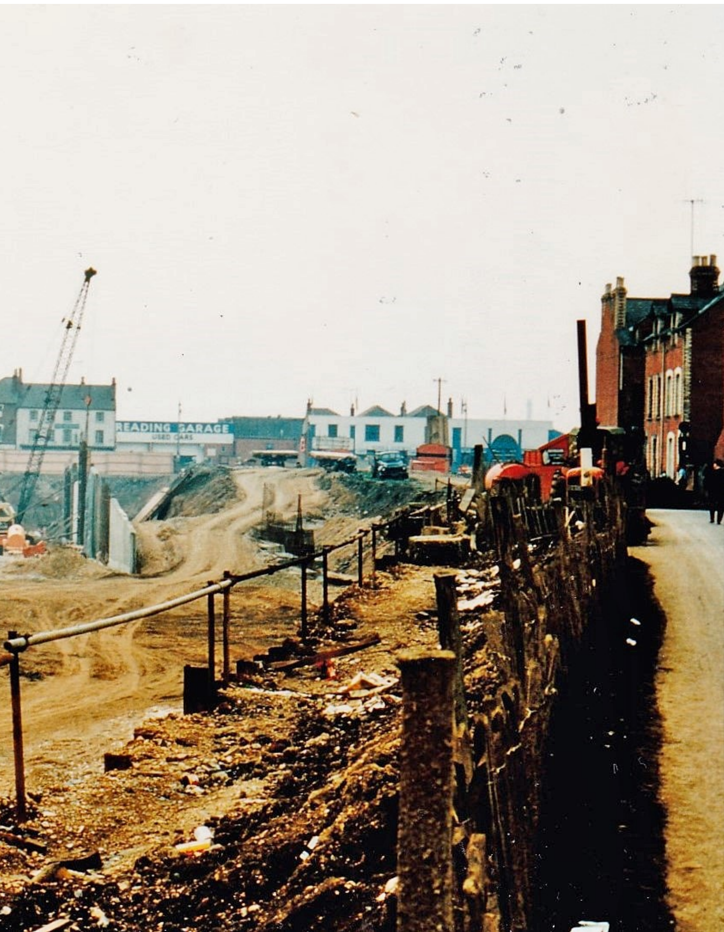
the far right are houses along Body Road