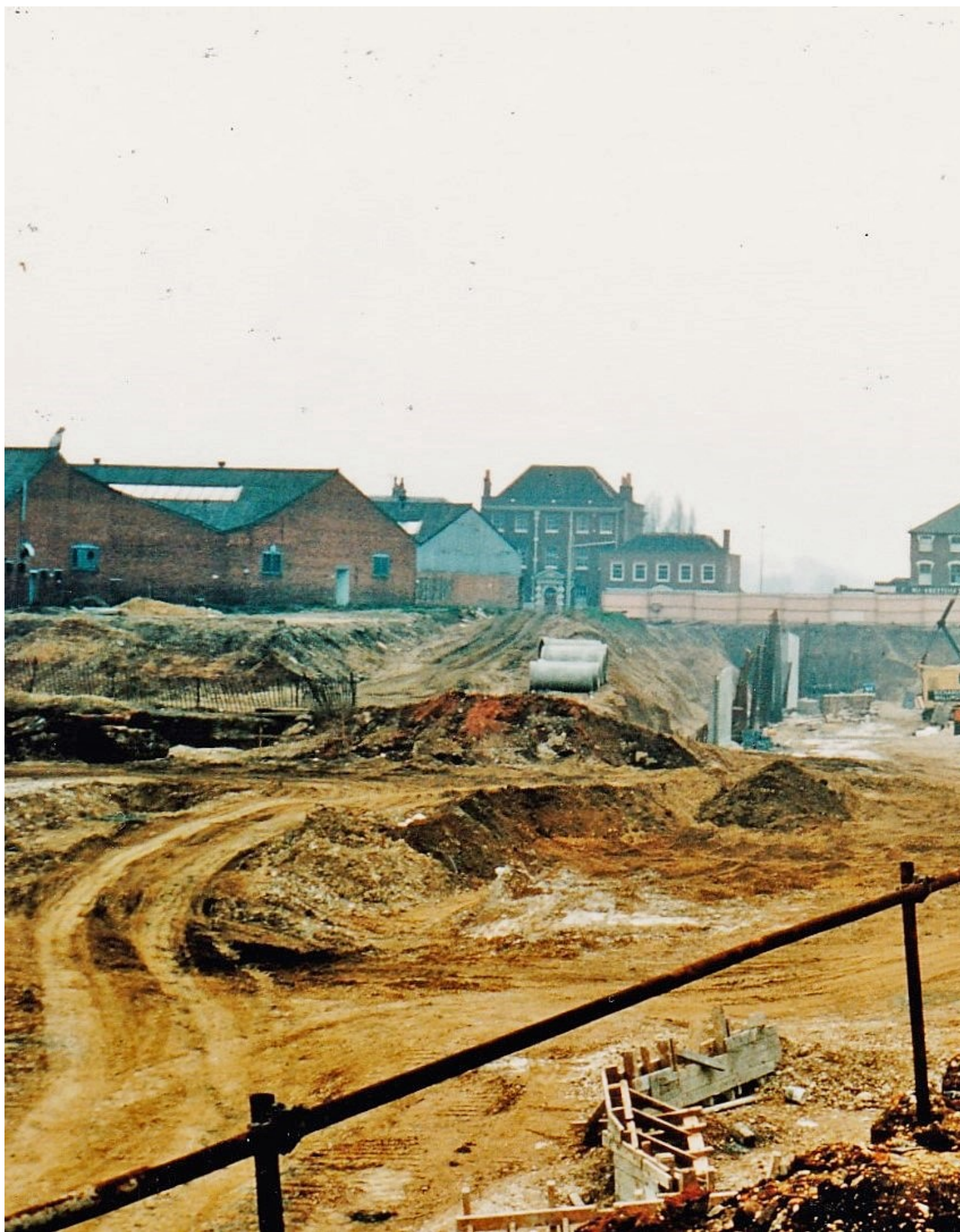
View from Howard Street c.1969 showing the IDR under construction. On t