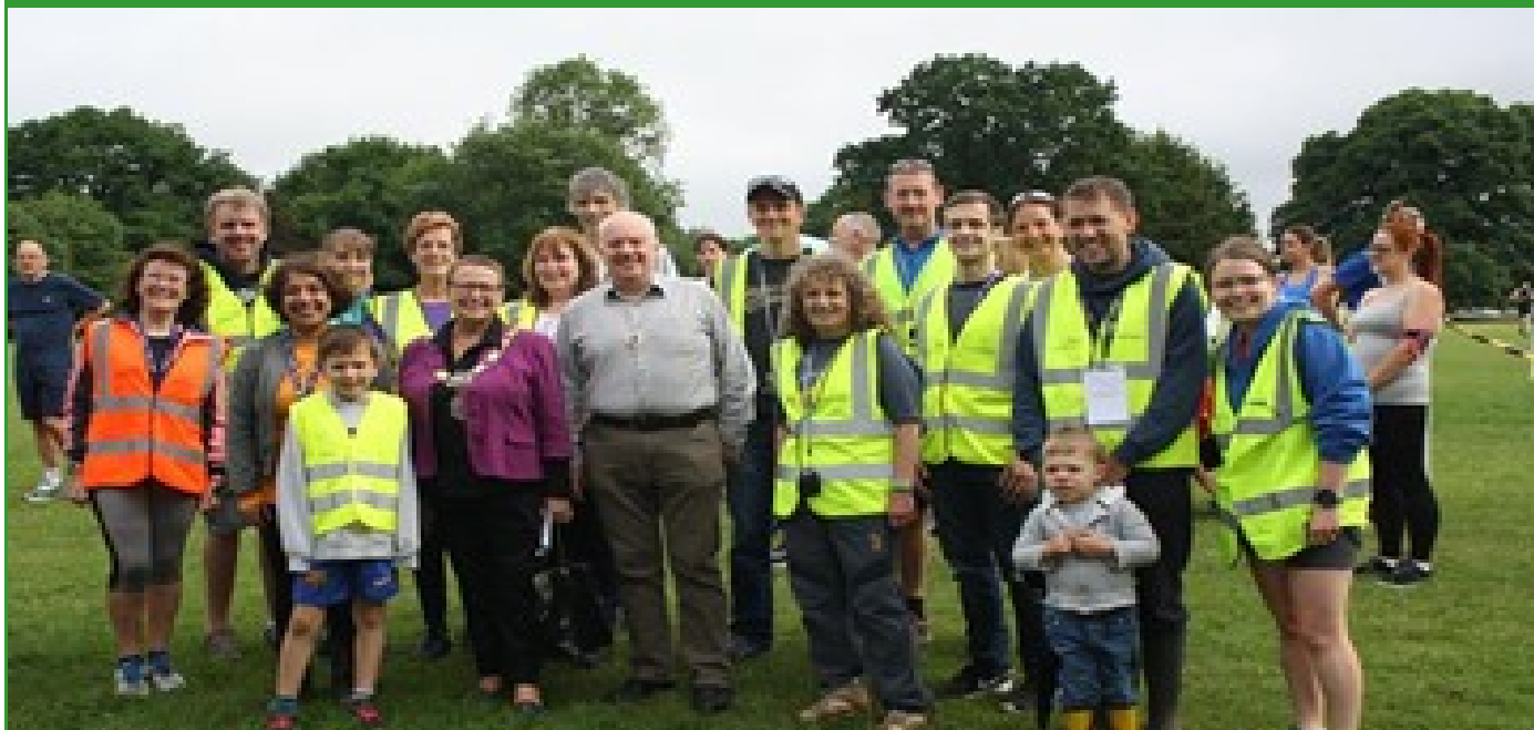
Prospect parkrun volunteers with the past Mayor of Reading