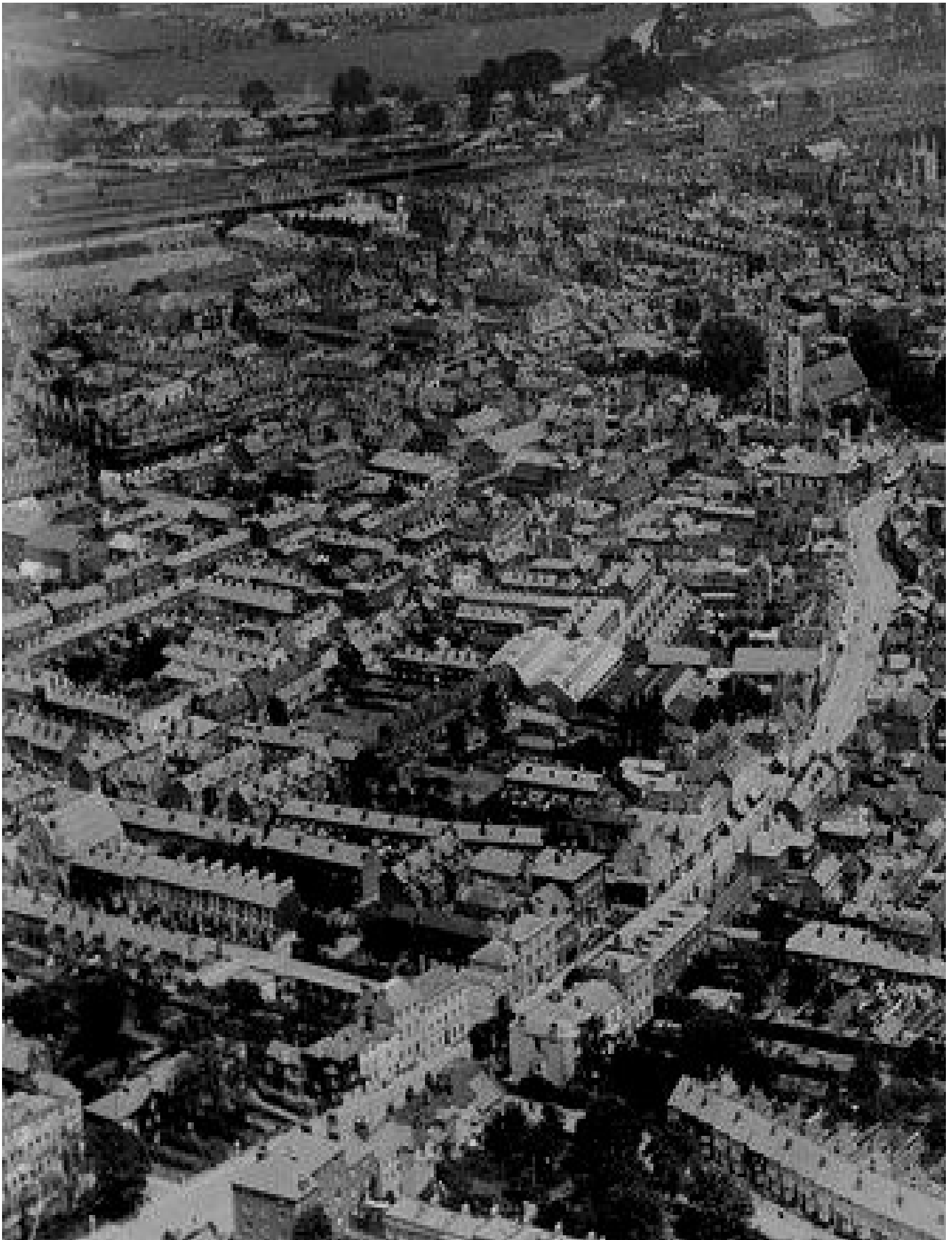
The year is 1920 and this view looks North-east across the Town Centre towards Reading Stations (GWR and SR) and the River Thames beyond. Reading bridge is absent because construction was not started until 1922.