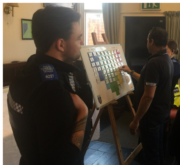
Just after 11am, and most of the tiles have been placed.