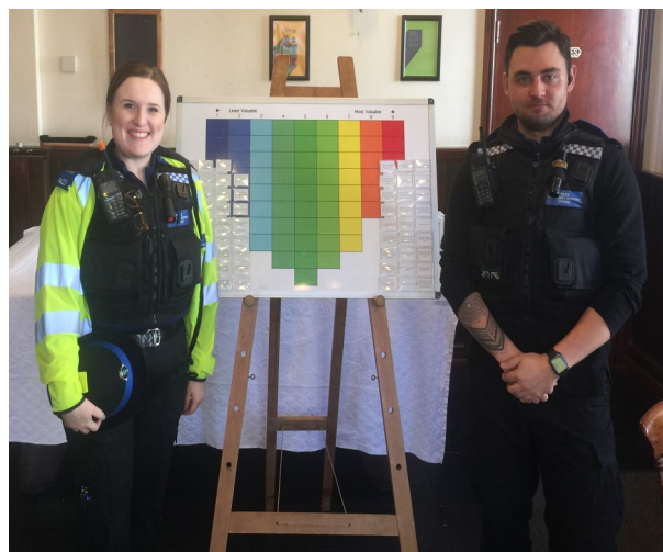
At the start, with all the activity tiles ready to be placed.

Thanks to everyone who helped gather the information, and we will do this again.